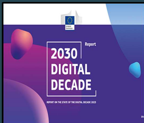
Digital Decade Policy Programme 2030