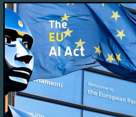
Artificial Intelligence Act