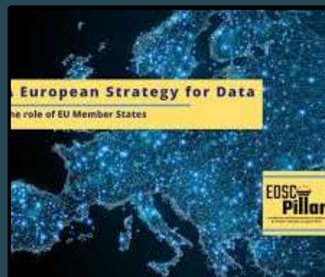
European Strategy for Data