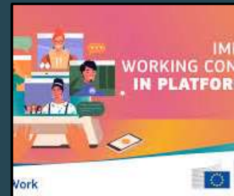
Platform Work Directive